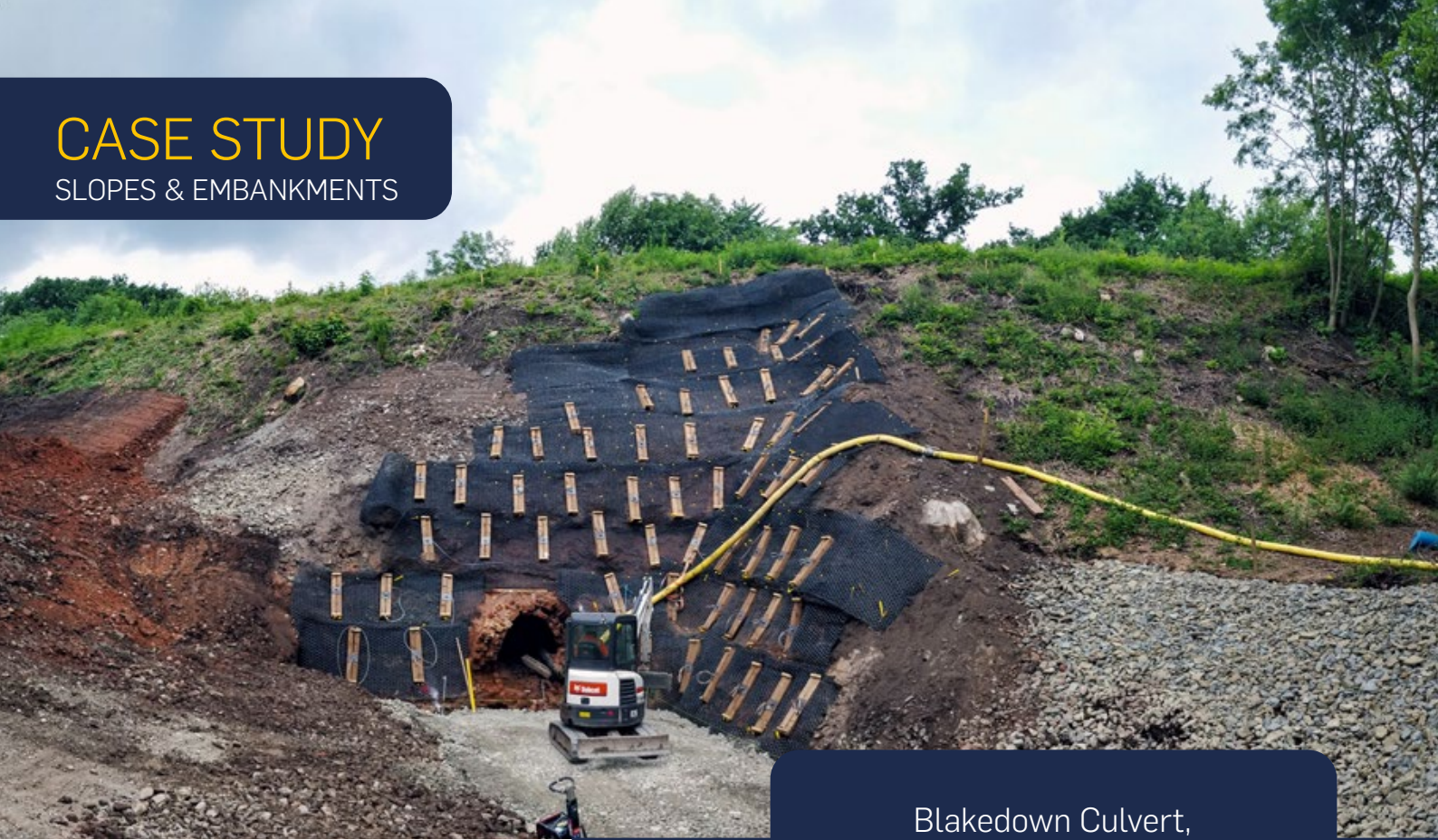
Blakedown Culvert, Worcestershire - UK